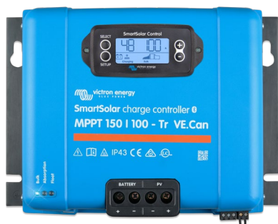
SmartSolar Charge Controller MPPT 150/100-Tr VE.Can with optional pluggable display