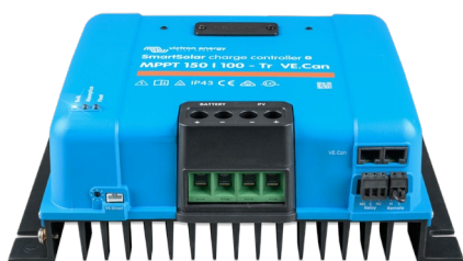
SmartSolar Charge Controller MPPT 150/100-Tr VE.CAN without display